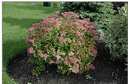
Goldflame Spirea in bloom