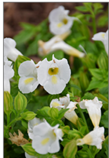
Catalina White Linen Torenia flowers