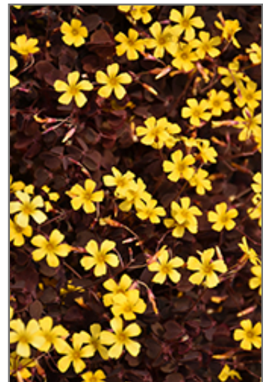
Burgundy Bliss Shamrock flowers