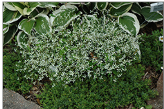
Diamond Frost Euphorbia in bloom