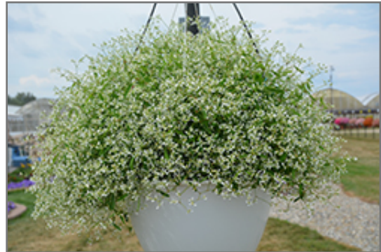
Diamond Frost Euphorbia in bloom

Diamond Frost Euphorbia will grow to be about 14 inches tall at maturity, with a spread of 24 inches. Its foliage tends to remain dense right to the ground, not requiring facer plants in front. This fast-growing annual will normally live for one full growing season, needing replacement the following year.