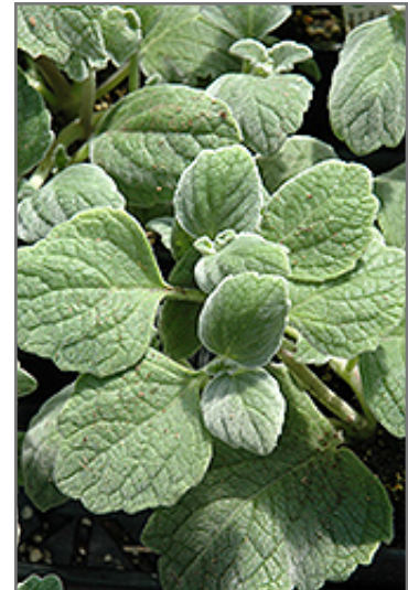
Nicoletta Swedish Ivy foliage