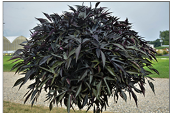
Illusion Midnight Lace Sweet Potato Vine