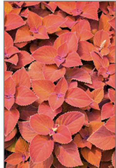
ColorBlaze Sedona Sunset Coleus foliage