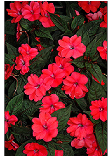
SunPatiens Compact Deep Rose New Guinea Impatiens flowers

SunPatiens Compact Deep Rose New Guinea Impatiens is a dense herbaceous annual with a mounded form. Its medium texture blends into the garden, but can always be balanced by a couple of finer or coarser plants for an effective composition.