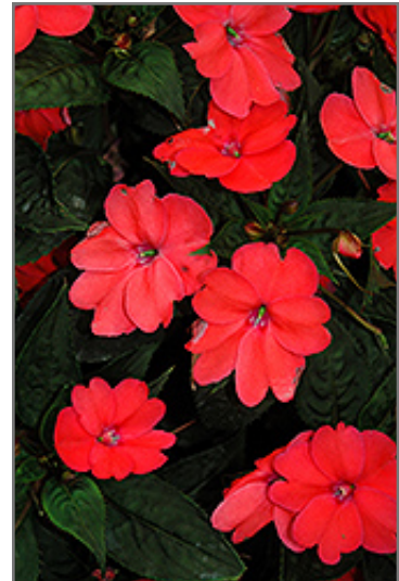
SunPatiens Compact Coral New Guinea Impatiens flowers

SunPatiens Compact Coral New Guinea Impatiens is recommended for the following landscape applications;