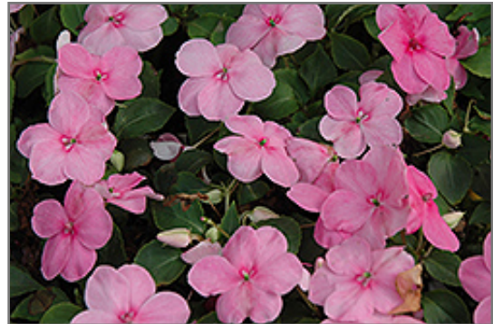
Super Elfin XP Pink Impatiens flowers

Super Elfin XP Pink Impatiens is recommended for the following landscape applications;