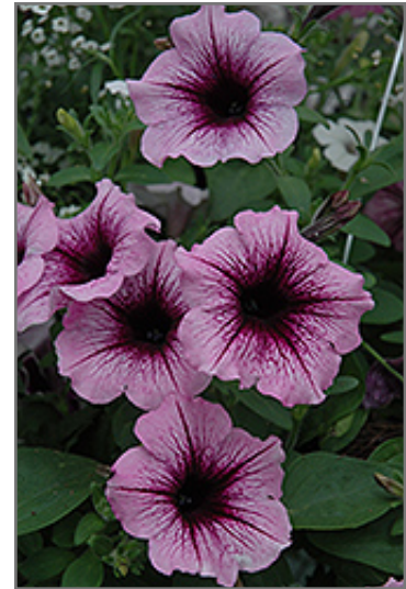
Supertunia Bordeaux Petunia flowers

Supertunia Bordeaux Petunia is recommended for the following landscape applications;