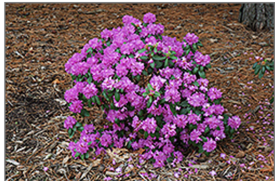
Compact P.J.M. Rhododendron in bloom