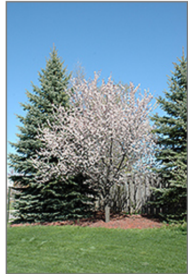
Newport Plum in bloom

This tree should only be grown in full sunlight. It does best in average to evenly moist conditions, but will not tolerate standing water. It is not particular as to soil type or pH. It is highly tolerant of urban pollution and will even thrive in inner city environments. This is a selected variety of a species not originally from North America.