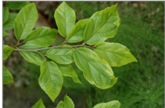
Variegated Sycoparrotia foliage