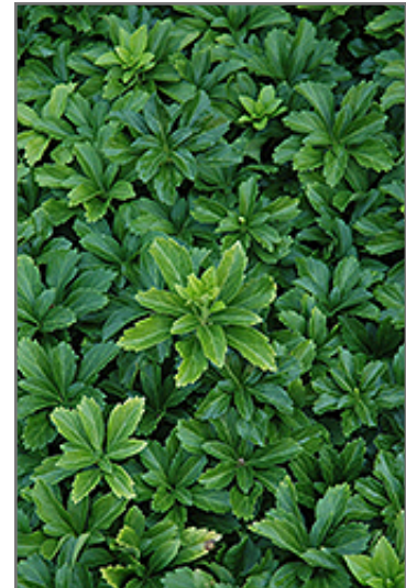
Green Sheen Japanese Spurge foliage