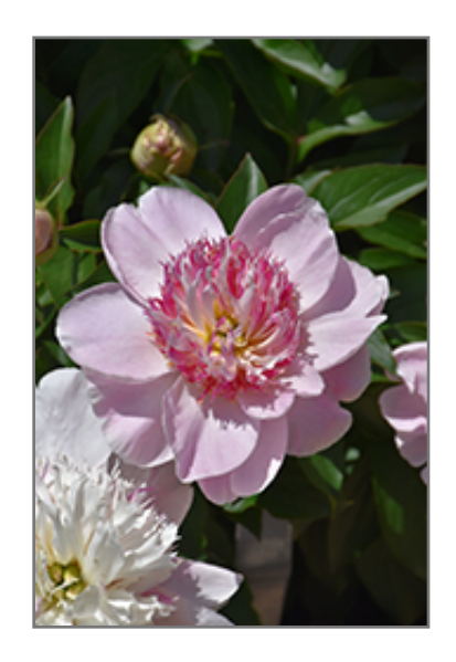
Do Tell Peony flowers