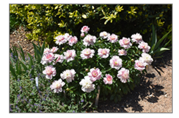
Do Tell Peony in bloom

7777 N. 76th Street Milwaukee, WI 53223 Phone: 414.354.4830 800. 236.4830