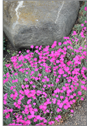
Firewitch Cheddar Pinks in bloom

4.5" CONT $6.49 / #1 CONT $12.99 / 8" CONT $14.99