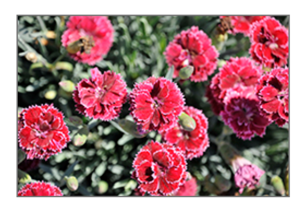
Fruit Punch Black Cherry Frost Pinks flowers

Fruit Punch Black Cherry Frost Pinks is recommended for the following landscape applications;