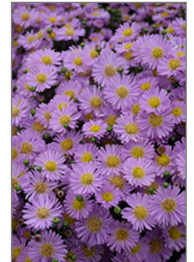
Kickin Pink Chiffon Aster flowers

7777 N. 76th Street Milwaukee, WI 53223 Phone: 414.354.4830 800. 236.4830