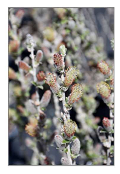
Iceberg Alley Sageleaf Willow flowers

7777 N. 76th Street Milwaukee, WI 53223 Phone: 414.354.4830 800. 236.4830