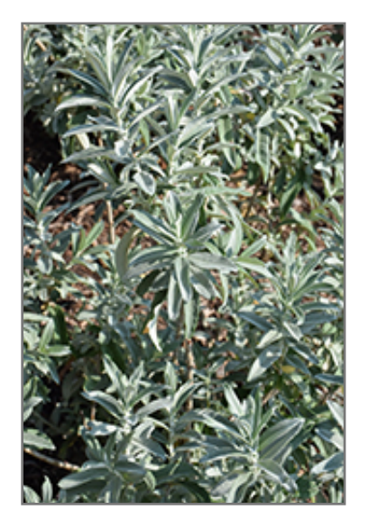
Iceberg Alley Sageleaf Willow foliage

This shrub should only be grown in full sunlight. It is quite adaptable, prefering to grow in average to wet conditions, and will even tolerate some standing water. It is not particular as to soil type or pH. It is highly tolerant of urban pollution and will even thrive in inner city environments. This is a selection of a native North American species.