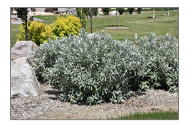
Iceberg Alley Sageleaf Willow

This shrub will require occasional maintenance and upkeep, and should only be pruned in summer after the leaves have fully developed, as it may 'bleed' sap if pruned in late winter or early spring. It has no significant negative characteristics.