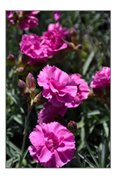
Scent First Tickled Pink Pinks flowers