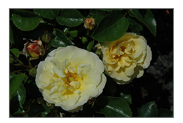
Popcorn Drift Rose flowers

7777 N. 76th Street Milwaukee, WI 53223 Phone: 414.354.4830 800. 236.4830