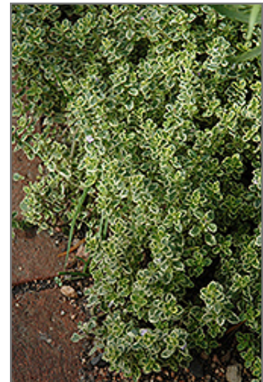
Variegated Lemon Thyme foliage