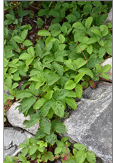
Wild Strawberry