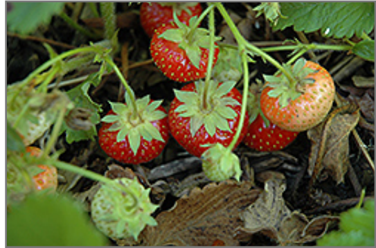
Wild Strawberry

Wild Strawberry features dainty white cup-shaped flowers with yellow eyes along the stems from late spring to early summer. Its attractive tomentose round compound leaves remain green in color throughout the season. It features an abundance of magnificent cherry red berries from late spring to late summer.