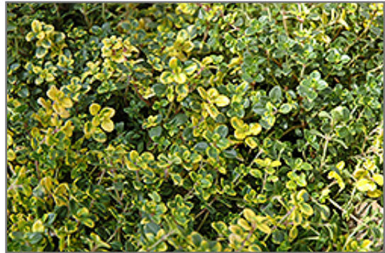
Doone Valley Thyme