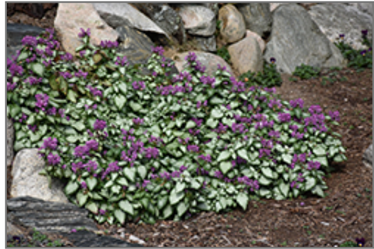
Purple Dragon Spotted Nettle in bloom