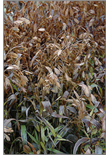
Northern Sea Oats in fall

This is a high maintenance plant that will require regular care and upkeep, and is best cleaned up in early spring before it resumes active growth for the season. It has no significant negative characteristics.