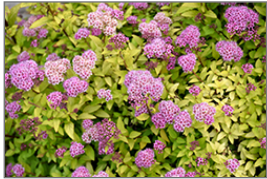
Sundrop Spiraea flowers

Sundrop Spiraea is recommended for the following landscape applications;