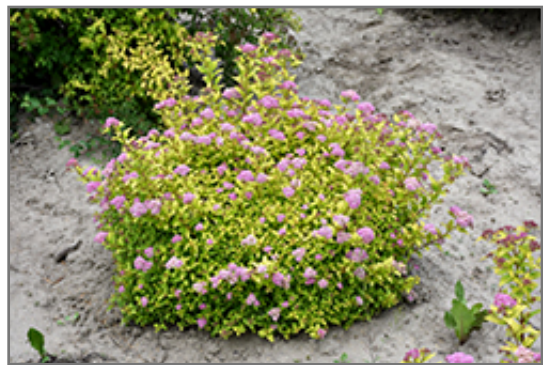
Sundrop Spiraea in bloom