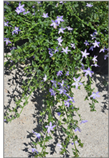
Blue Waterfall Bellflower in bloom