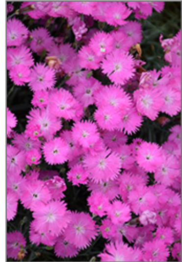
Firewitch Cheddar Pinks flowers