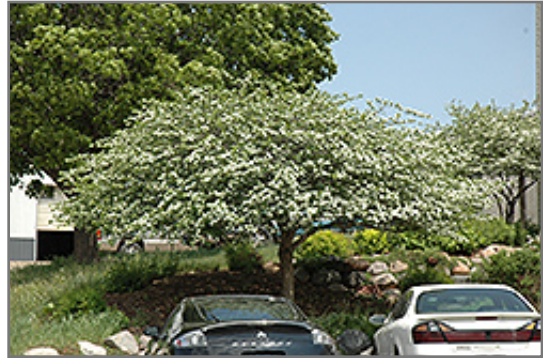
Thornless Cockspur Hawthorn in bloom