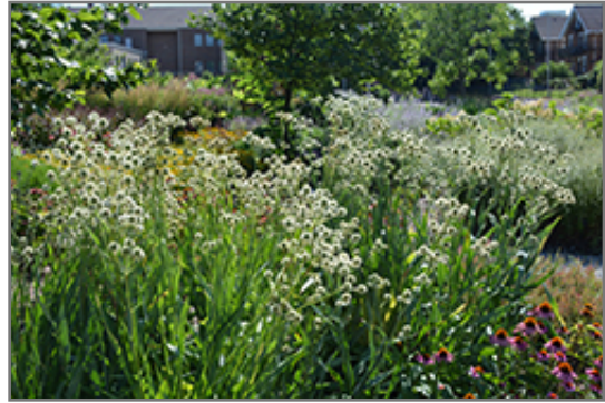
Rattlesnake Master in bloom