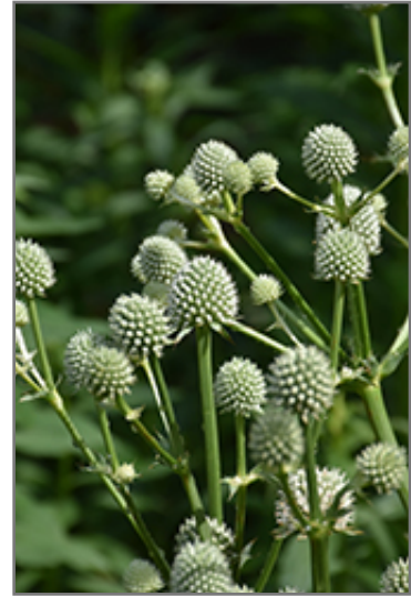
Rattlesnake Master flowers

Rattlesnake Master is an herbaceous perennial with a mounded form. Its relatively fine texture sets it apart from other garden plants with less refined foliage.