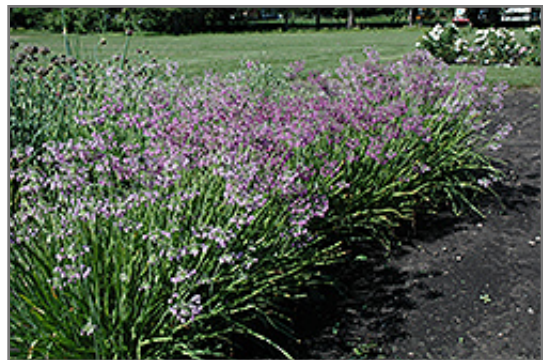
Nodding Pink Onion in bloom