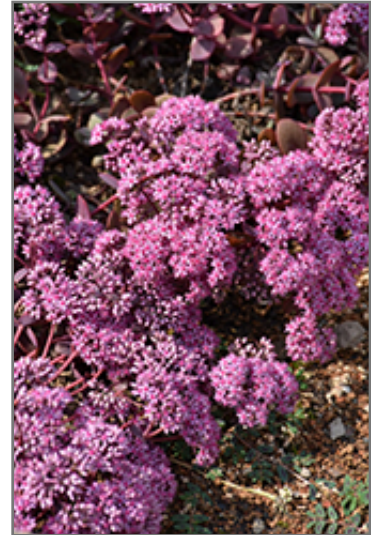
SunSparkler Cherry Tart Stonecrop flowers