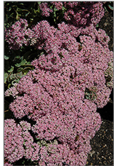
SunSparkler Lime Zinger Stonecrop flowers

This is a high maintenance plant that will require regular care and upkeep, and is best cleaned up in early spring before it resumes active growth for the season. It is a good choice for attracting bees and butterflies to your yard, but is not particularly attractive to deer who tend to leave it alone in favor of tastier treats. It has no significant negative characteristics.