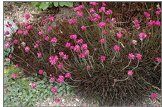
Red-leaved Sea Thrift in bloom