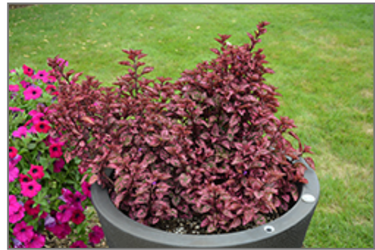
Hippo Rose Polka Dot Plant