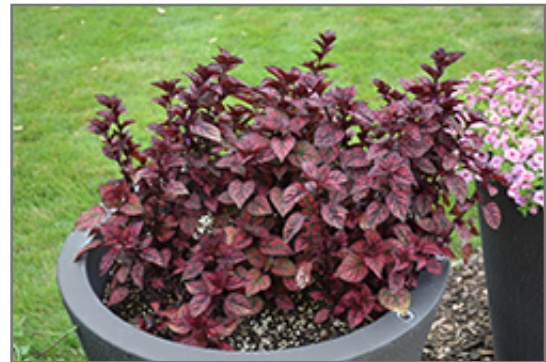
Hippo Red Polka Dot Plant