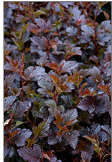
Petite Plum Ninebark foliage