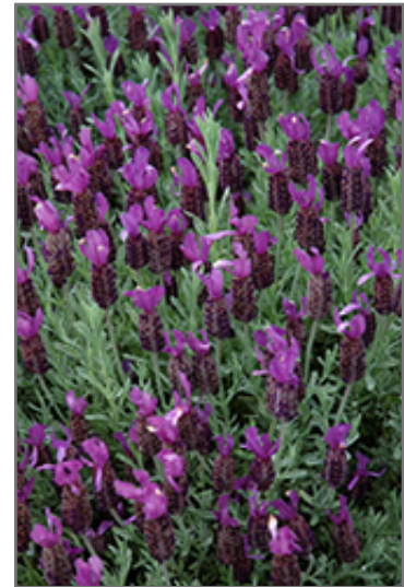
Anouk Supreme Spanish Lavender flowers

Anouk Supreme Spanish Lavender is recommended for the following landscape applications;