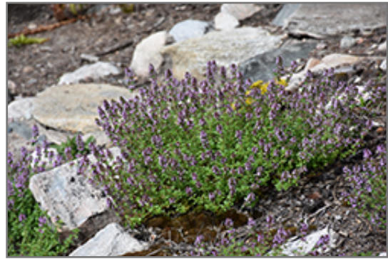
Lemon Thyme in bloom

This plant is quite ornamental as well as edible, and is as much at home in a landscape or flower garden as it is in a designated herb garden. It should only be grown in full sunlight. It prefers to grow in average to dry locations, and dislikes excessive moisture. It is considered to be drought-tolerant, and thus makes an ideal choice for a low-water garden or xeriscape application. It is not particular as to soil type or pH. It is highly tolerant of urban pollution and will even thrive in inner city environments. Consider covering it with a thick layer of mulch in winter to protect it in exposed locations or colder microclimates. This particular variety is an interspecific hybrid. It can be propagated by division; however, as a cultivated variety, be aware that it may be subject to certain restrictions or prohibitions on propagation.