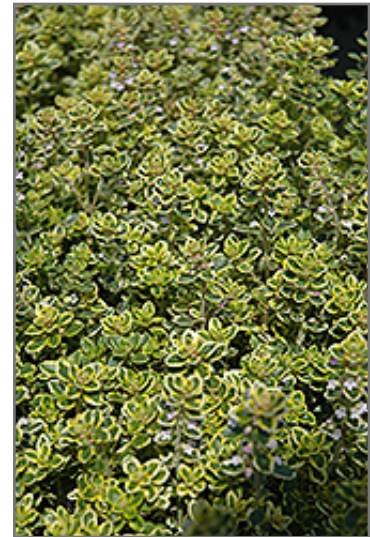
Lemon Thyme foliage

Lemon Thyme is smothered in stunning spikes of lilac purple flowers rising above the foliage from early to late summer. Its attractive tiny fragrant round leaves remain light green in color throughout the year.