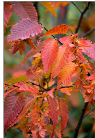
Firespire American Hornbeam in fall