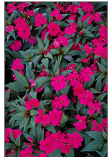
SunPatiens Compact Royal Magenta New Guinea Impatiens flowers