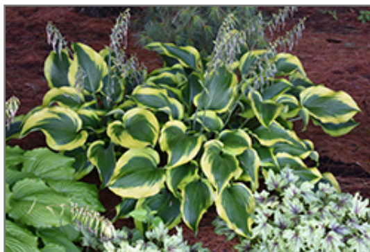
Atlantis Hosta

Atlantis Hosta is recommended for the following landscape applications;