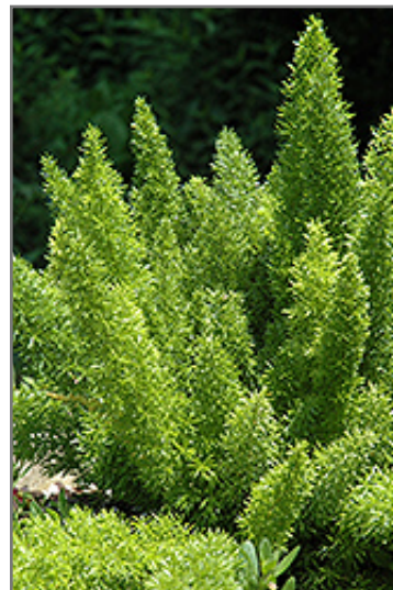
Foxtail Fern