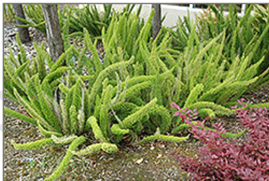
Foxtail Fern