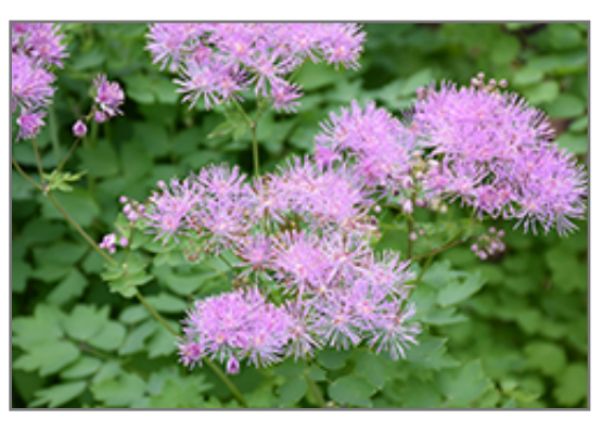
Meadow Rue flowers