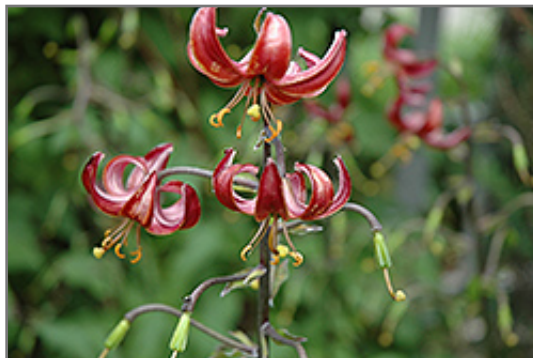
Claude Shride Martagon Lily flowers

Claude Shride Martagon Lily is recommended for the following landscape applications;