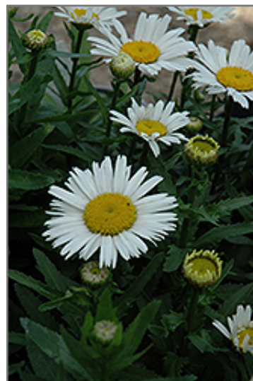
Snow Lady Shasta Daisy flowers

Snow Lady Shasta Daisy is recommended for the following landscape applications;