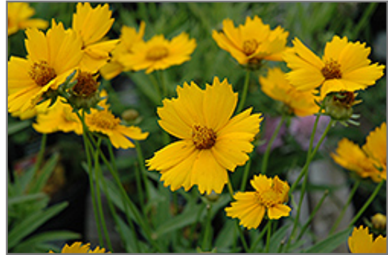
Baby Sun Tickseed flowers