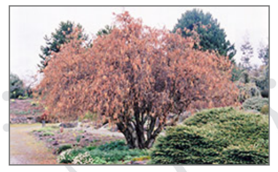
Harry Lauder's Walking Stick in winter

This is a high maintenance shrub that will require regular care and upkeep, and is best pruned in late winter once the threat of extreme cold has passed. Gardeners should be aware of the following characteristic(s) that may warrant special consideration;