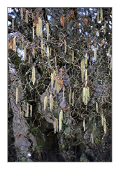
Harry Lauder's Walking Stick flowers

Harry Lauder's Walking Stick is a multi-stemmed deciduous shrub with a more or less rounded form. Its relatively coarse texture can be used to stand it apart from other landscape plants with finer foliage.